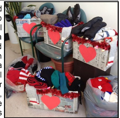
Piles of Caring at LOWDH

Kay'shi'daay'ing - Where We Live and we must support each other in making Kenora a community that cares.