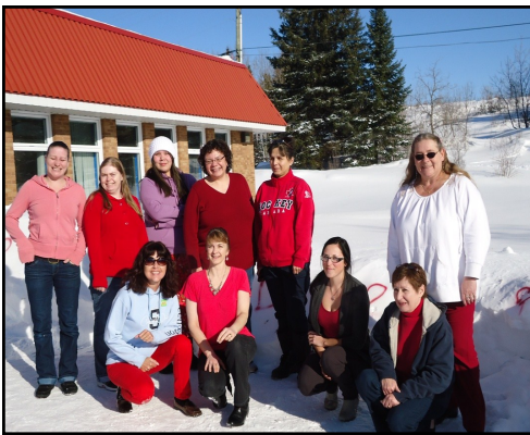
Confederation College Wear Their Care

Schools also contributed to the week's success. Confederation College brightened with their participation in Wear Red Day on February 14. College students developed and launched a facebook page for easy public recording of WAAP activities.