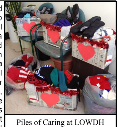
Piles of Caring at LOWDH

Kay'shi'daay'ing - Where We Live and we must support each other in making Kenora a community that cares.