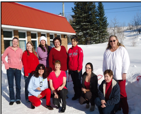
Confederation College Wear Their Care

Schools also contributed to the week's success. Confederation College brightened with their participation in Wear Red Day on February 14. College students developed and launched a facebook page for easy public recording of WAAP activities.