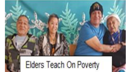
Elders Teach On Poverty