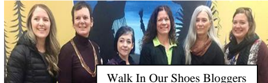
Walk In Our Shoes Bloggers

(Valleyview) to fundraising (PJP II). Red ribbons and prayers wove through the community. The blogged experiences of the Walk in Other Shoes