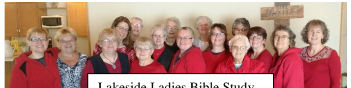
Lakeside Ladies Bible Study

participants were shared through the web world. Wear Red, office fundraisers and concerts filled activity calendars.