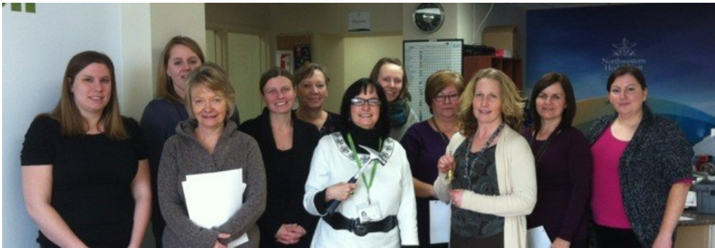
The NW Health Unit "Flash Song" team sang "If I Had a Hammer" along with many other teams during the Week of Action Against Poverty, 2013.