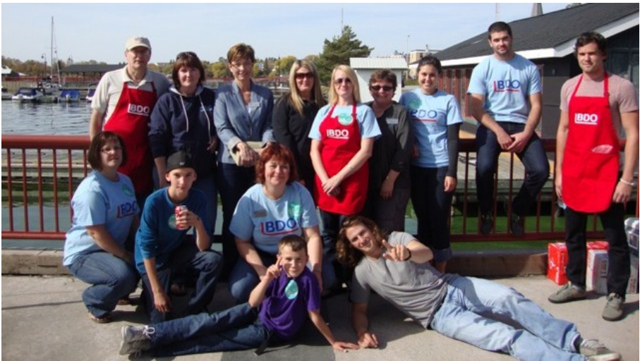
A happy group of BDO barbecue volunteers!